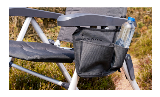
SIDE POCKET FOR CHAIR Fits most Isabella chairs and sunbed. (from 2018)